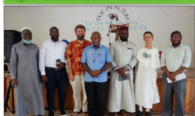
Cardinal with Muslim and Protestant representatives at CTI

Page 4 - Catholic Reporter - December 2020