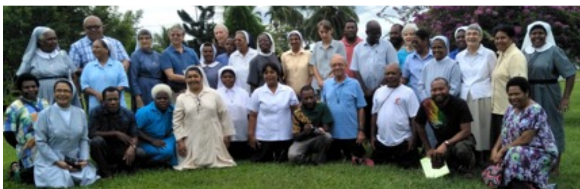
Statement from the Federation of Religious Papua New Guinea and Solomon Islands

We the leaders of the Catholic Religious Congregations, of priests, brothers and sisters of Papua New Guinea and Solomon Islands gathered for our Annual meeting at Alexishafen, Madang Province from the 10 th – 17 th March 2018. We are saddened by the recent earthquake in the Hela and Southern Highlands Provinces and we put forward our statement.