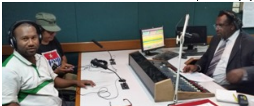
The Alliance of Solwara Warriors at radio talkback after the objections lodging

The Alliance of Solwara Warriors through the Caritas PNG Kavieng Diocese and the West Coast Development Foundation have made their presence known in the Wardens Hearing pledging that their ultimate goal is to halt the Solwara Project and Ban seabed mining in New Ireland, PNG and the Pacific.