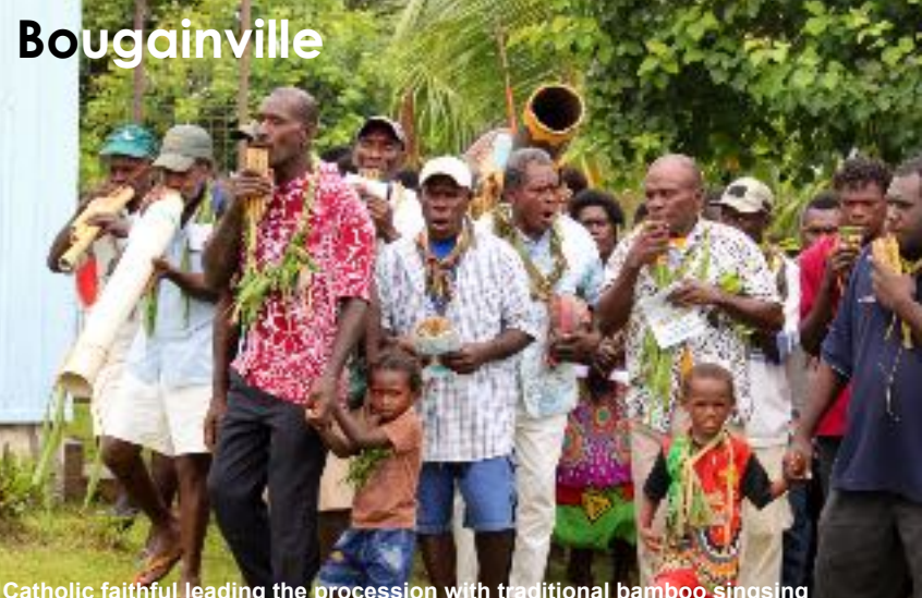
the different way of Church's presence to the people in Bougainville.

opinions". The Vicar General of the Diocese "The radio station will be a unique way of of Bougainville, Fr. Polycarp confirmed the outlined role of the Church and said that, the Church will help the people of Bougainville during the processes leading to the Referendum and beyond by through reconciliation services. Apart from the celebrations, the Diocese launched its first radio station, DOB FM 103.1. The launch was aimed at presenting, for the first time,