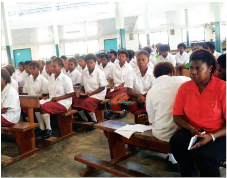
Students and teachers during a school mass.

Caritas Sisters of Jesus are asking your prayers for this newly started fragile mission in Papua New Guinea. Their first Kimbe 'convent' is still a wonderfully colored 20 tons red container!