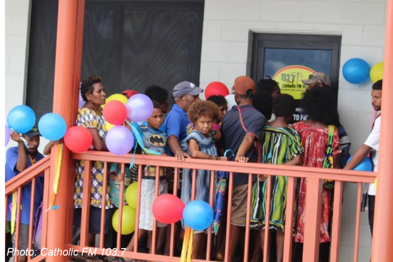
Catholic faithful gathering to see the Catholic FM studio

Lae: World Communication Day in the Diocese of Lae was marked by the blessing and official opening of the new Chancery and Catholic FM radio station on 2<sup>nd</sup> June, 2019.