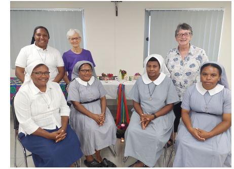
Group picture of participants and the facilitators

The five nuns who attended the program are from the Missionary Sisters of the