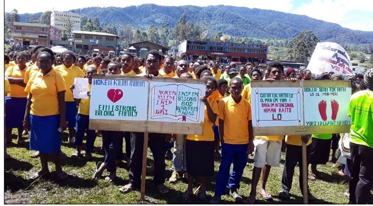
March at Momei Oval on 10th August.

Mendi, Southern Highlands: The Catholic community in the Diocese of Mendi with members from other Churches joined in the First International Day against Witchcraft and Sorcery Accusation advocacy awareness on 10<sup>th</sup> August 2020 at Momei Oval.