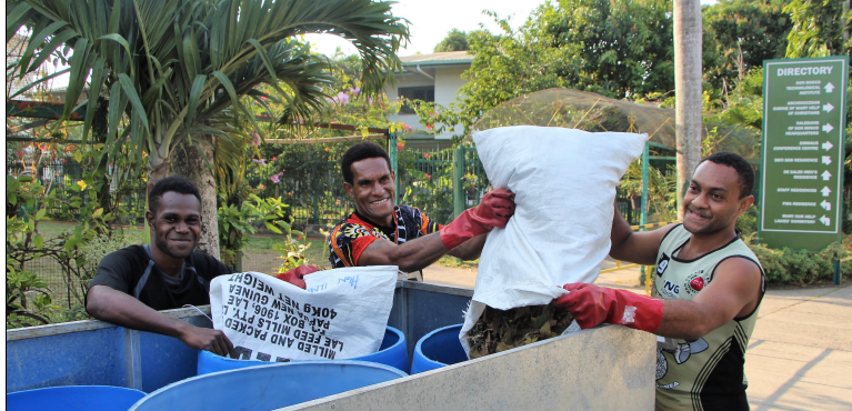
DBTI students collecting and sorting rubbish in a big aluminium cart

Page 2 - Catholic Reporter - August 2020