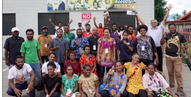
Participants of the Communications Seminar in front of Lae's Catholic FM studio.

Lae: 27 representatives from the different parishes in the Diocese of Lae gathered for a week-long Communications Seminar that focused on communicating the 'Good News' through the different platforms of media.