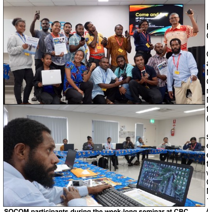
SOCOM participants during the week-long seminar at CBC

Port Moresby: 'Hope Amidst COVID-19' was the inspirational theme for the 2021 Social Communication Seminar held from Monday 22nd to