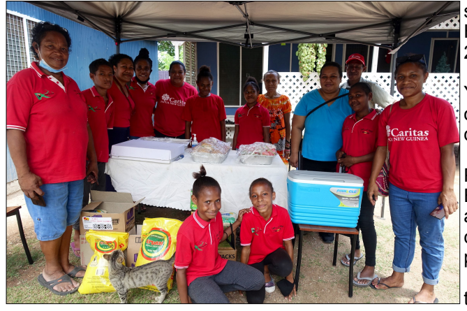
Caritas and Youth Commission team with the Links of Hope Orphanage staff and children with food items

Gerehu, Port Moresby: Caritas PNG and the Youth Commission of Catholic Bishops Conference paid a