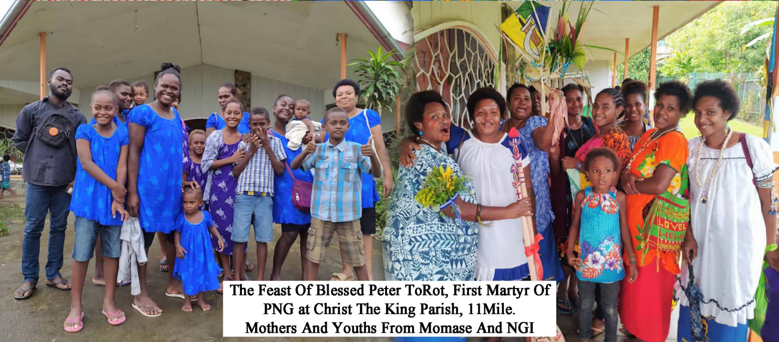
The Feast Of Blessed Peter ToRot, First Martyr Of PNG at Christ The King Parish, 11Mile. Mothers And Youths From Momase And NGI