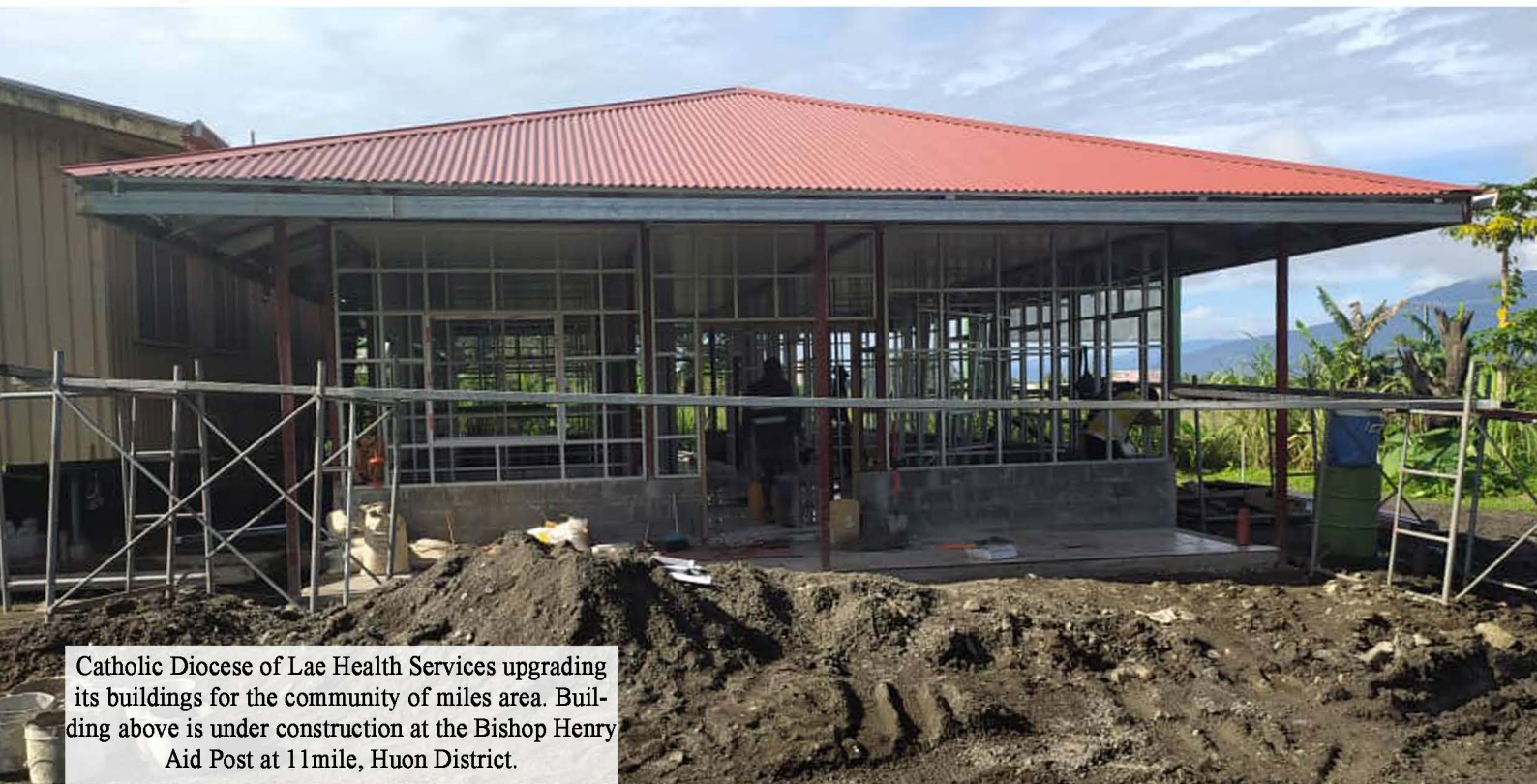
Catholic Diocese of Lae Health Services upgrading its buildings for the community of miles area. Building above is under construction at the Bishop Henry Aid Post at 11 mile, Huon District.